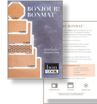
Product Card Sample