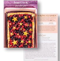
Recipe Card Sample

*Additional marketing materials included