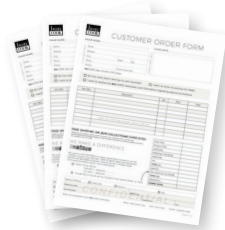
Order Forms (20)