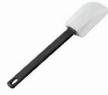
Heat Resistant Spatula