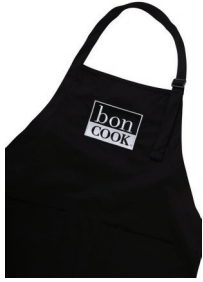
bon COOK Apron